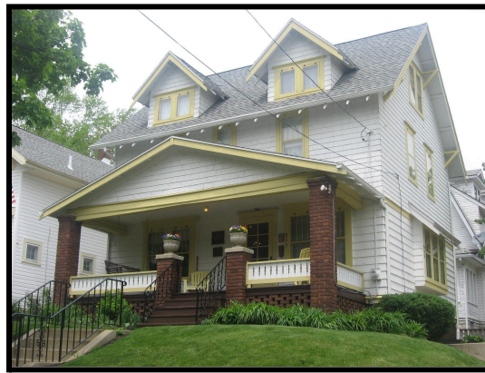
Dr. Bob's home in Akron, OH. Dr. Bob passed away on November 16, 1950.